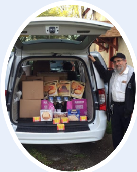
Hinda Awesome Kids Receiving Chanukkah Gifts